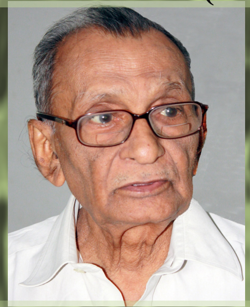
On 24th May 2024